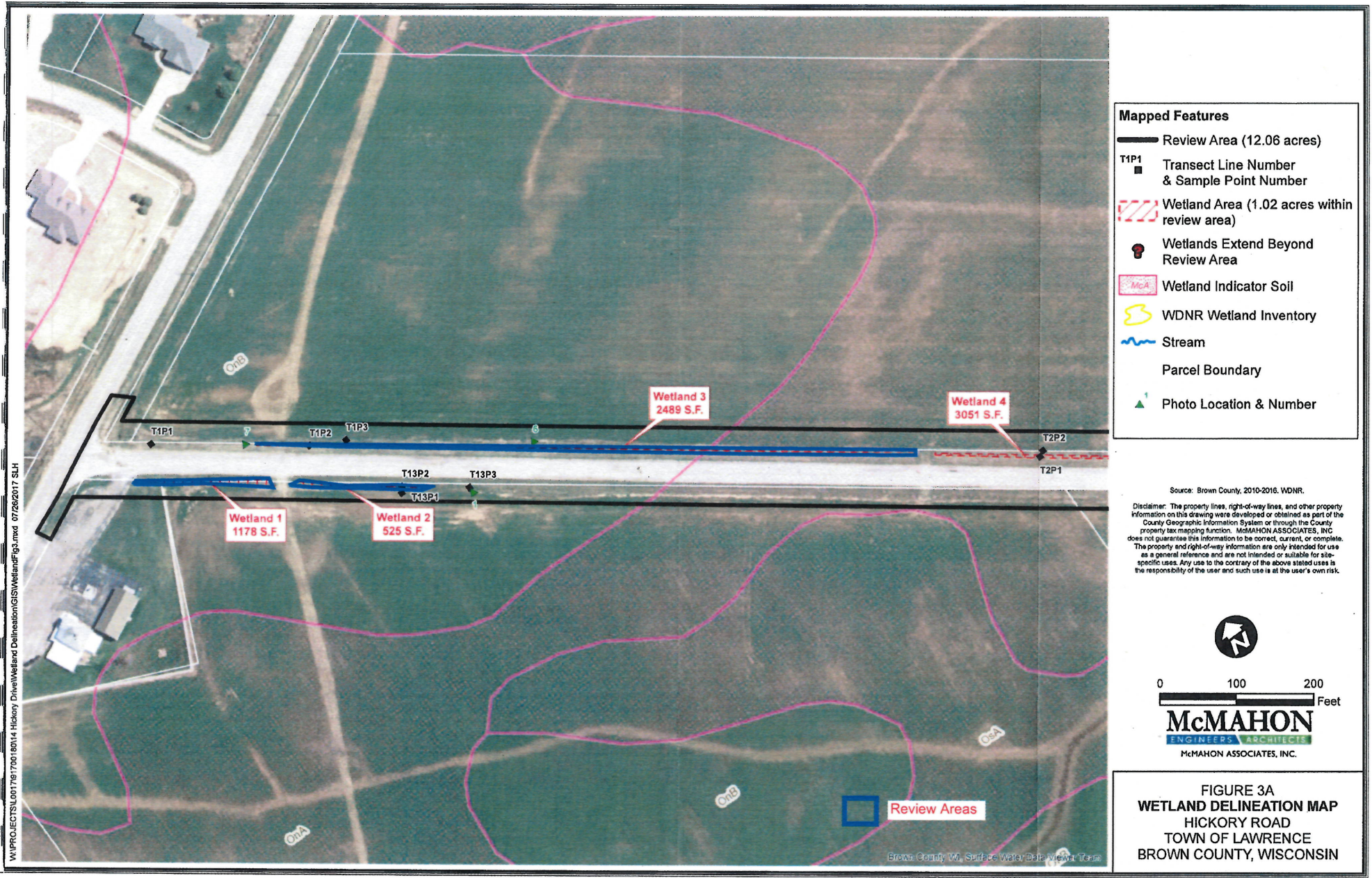
2017-03434-JLK (Figure 2 of 4)