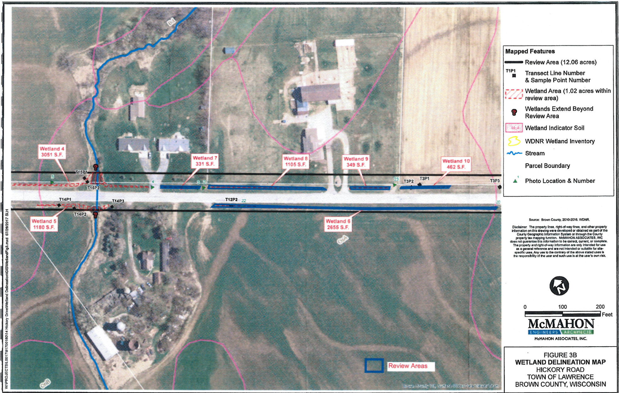
2017-03434-JLK (Figure 3 of 4)