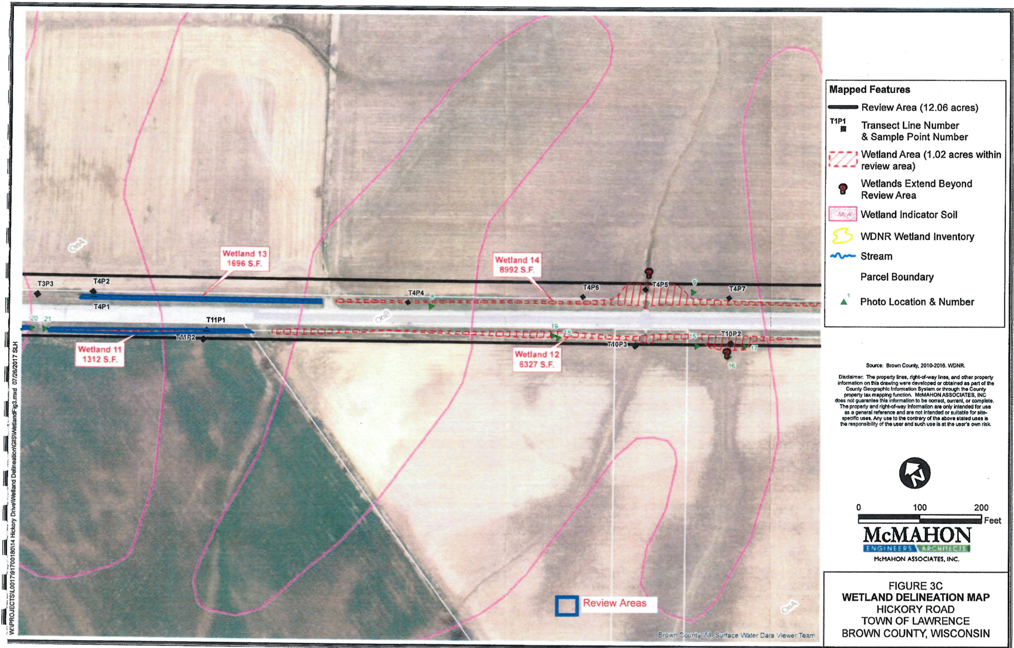
2017-03434-JLK (Figure 4 of 4)