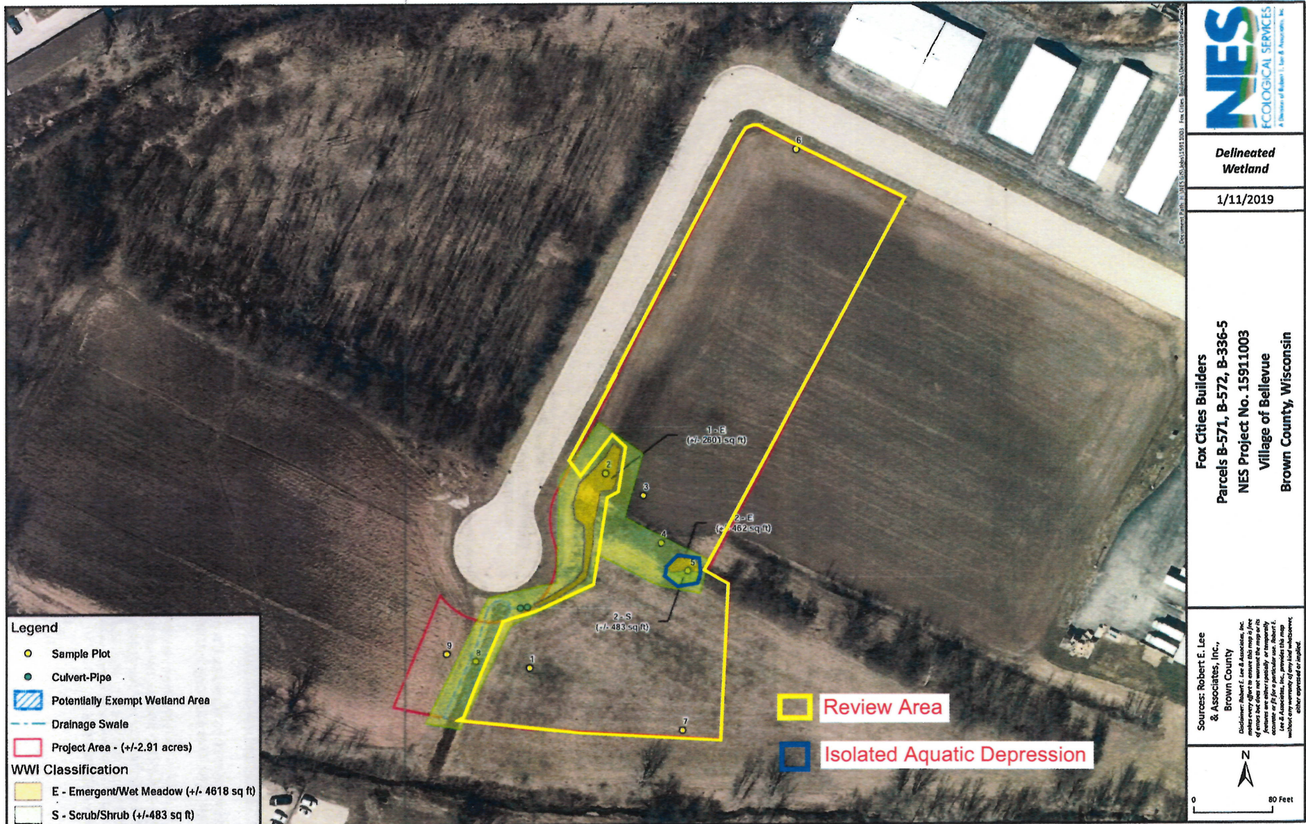
2019-00275-JLK (Figure 2 of 2)