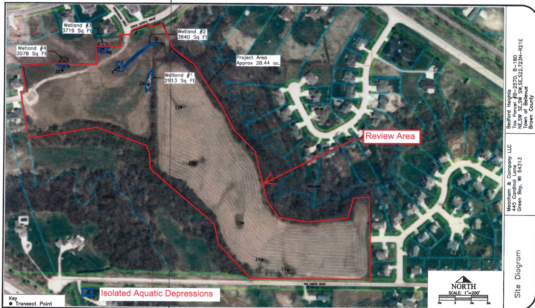
2019-00254-JLK (Figure 2 of 2)