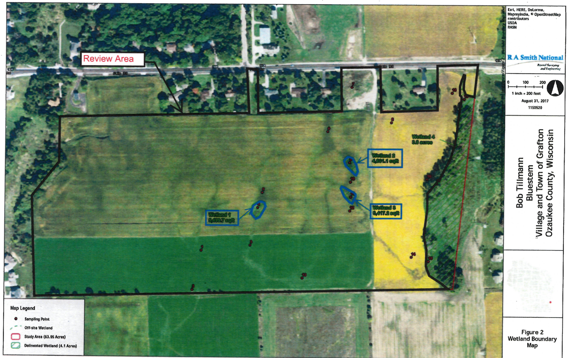
2019-00069-JLK (Figure 2 of 2)