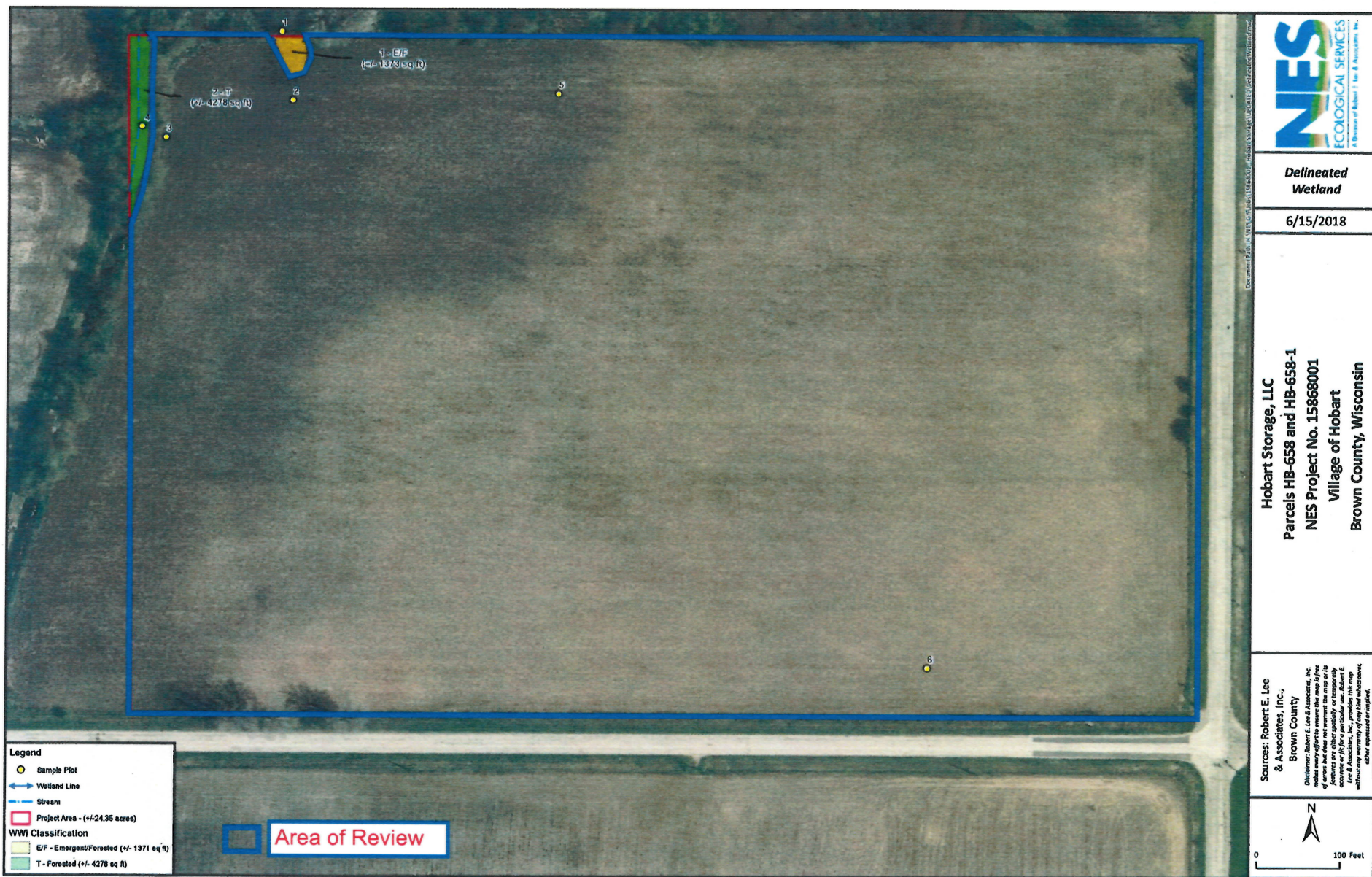
2018-01801-JLK (Figure 2 of 2)