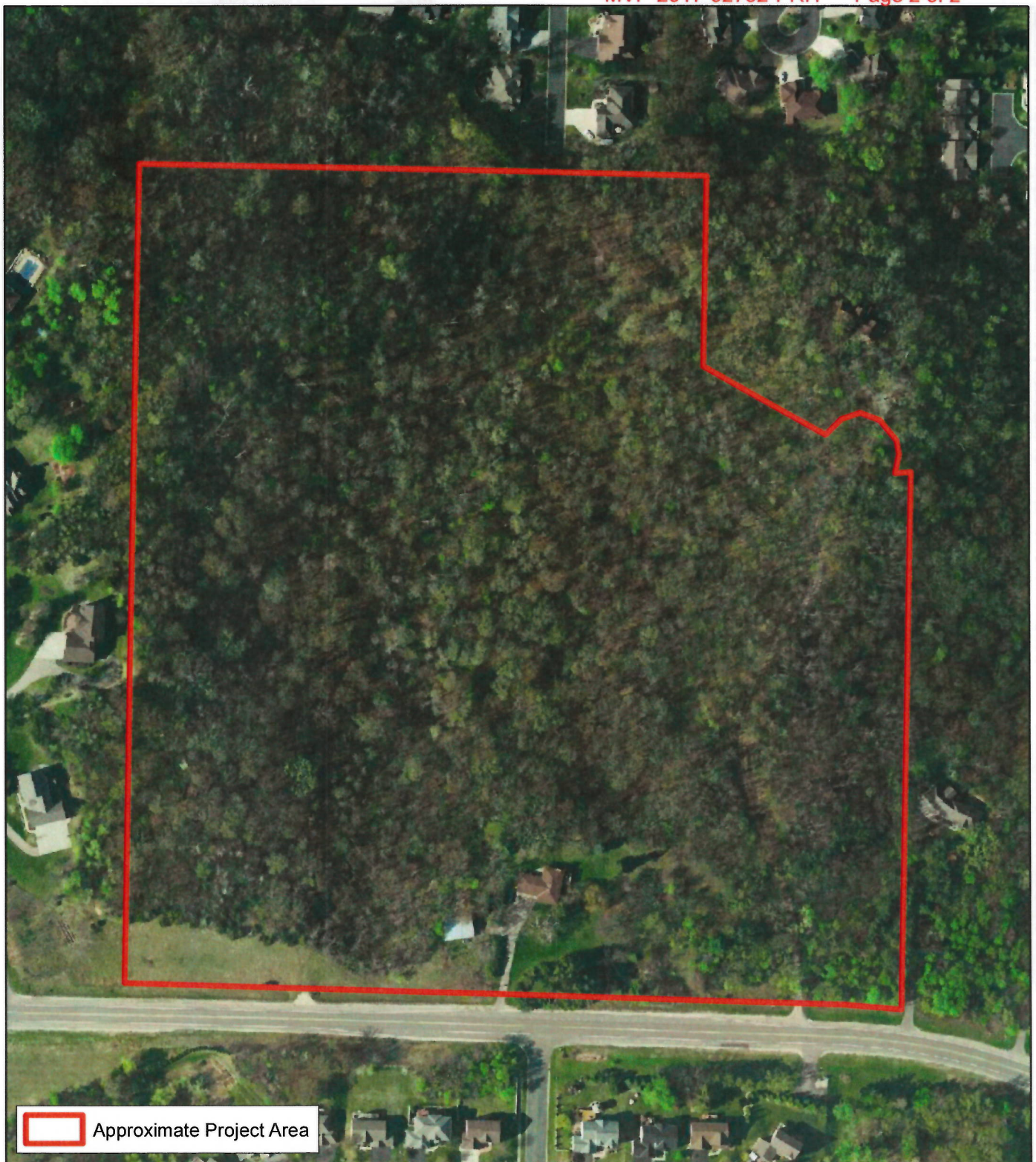
Figure 2A - Existing Conditions