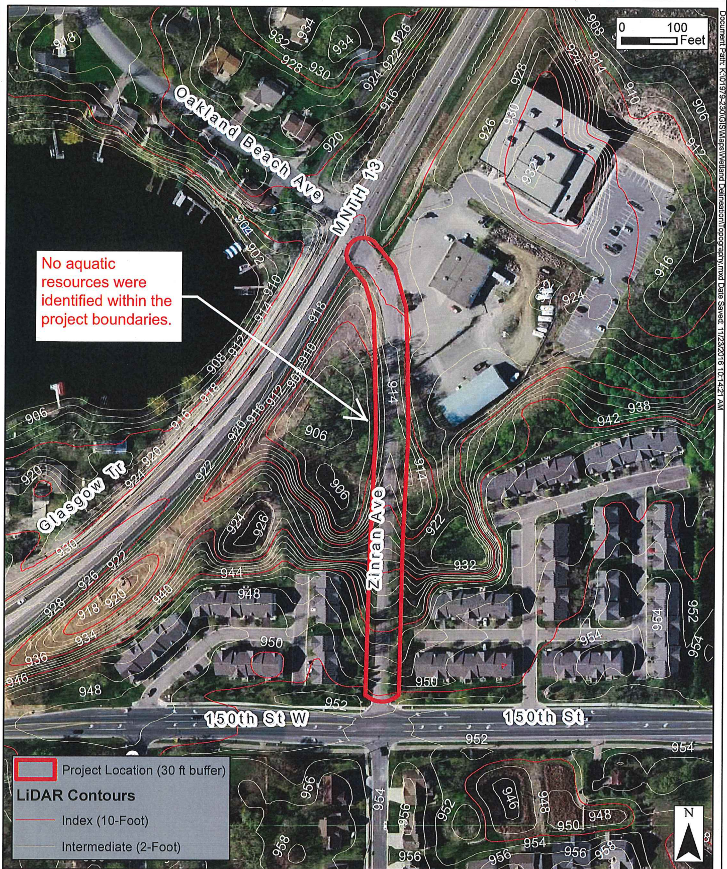
Figure 2 - Topography Zinran Avenue Improvements City of Savage, MN