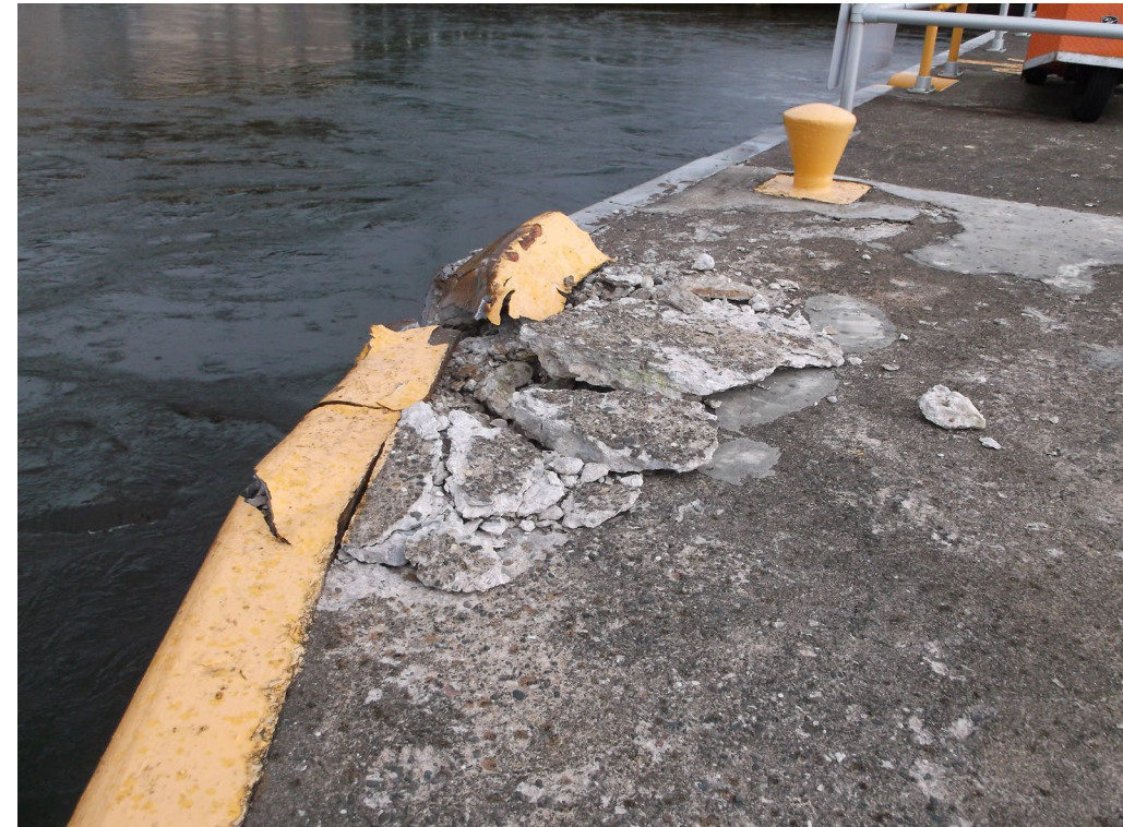
LD 4 I-wall US bullnose