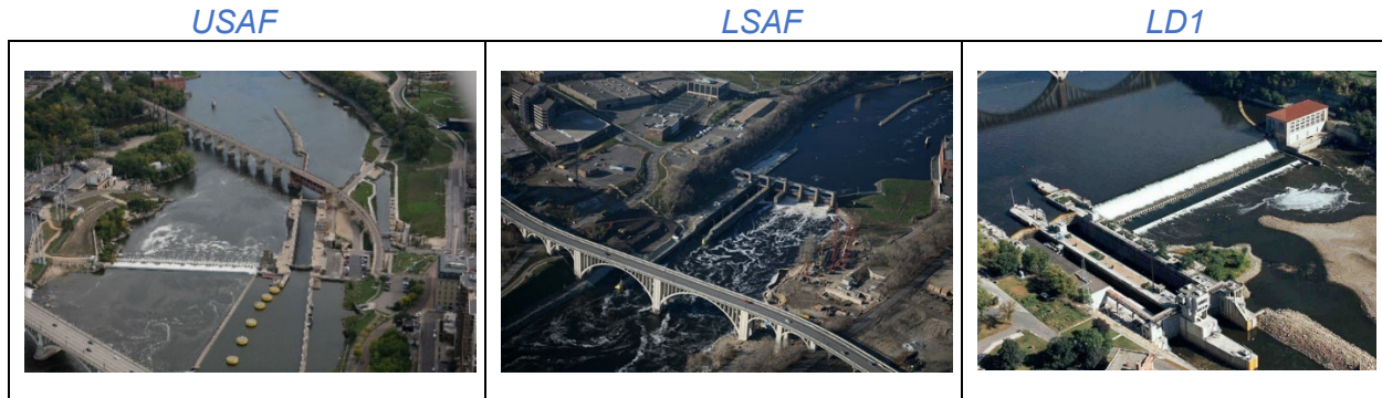
Figure 1. Corps of Engineers Locks and Dams at USAF, LSAF, and LD1.

directed the closure of USAF. Historically, dredge material was placed temporarily at designated beneficial use sites for local use. Other navigation infrastructure or lands under Corps' jurisdiction in this reach may include mooring structures, easements, and fee title land. The Corps built the projects and continues to operate and maintain these sites in accordance with laws and regulations.