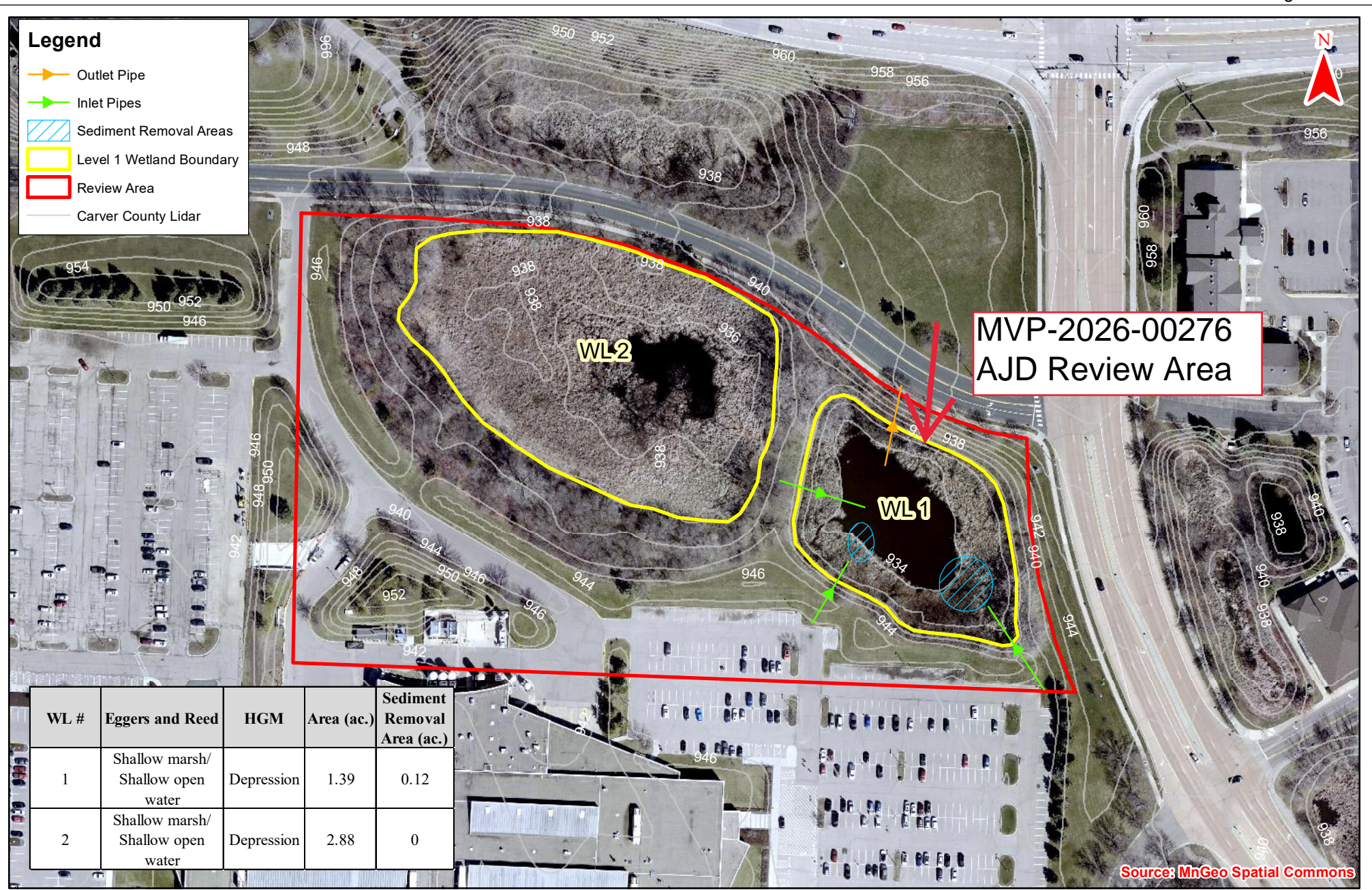
Figure 8 - Sediment Removal Areas (2024 Carver County)

8200 Market Blvd (KES 2026-017) Chanhassen, Minnesota