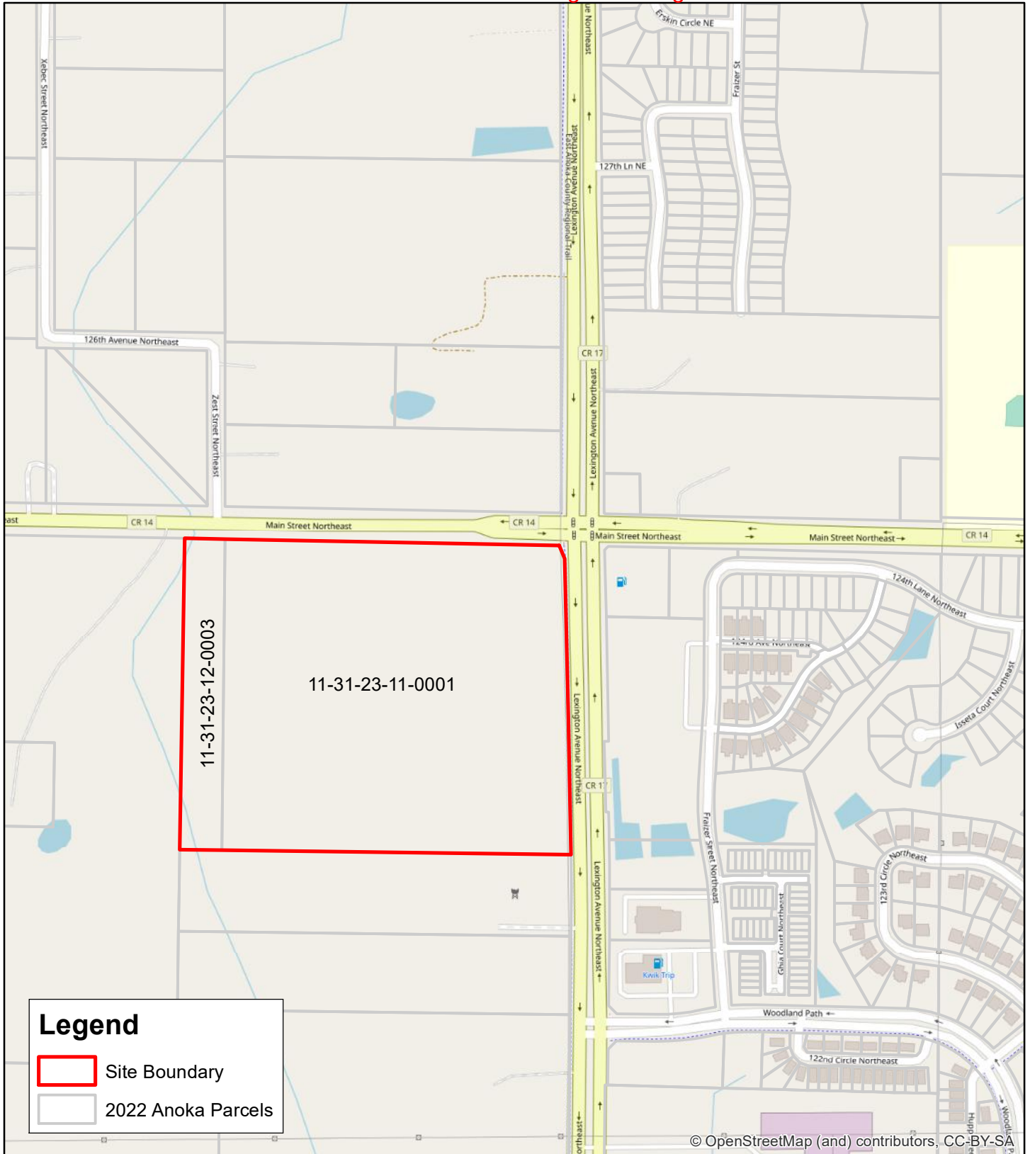
Figure 1 - Site Location