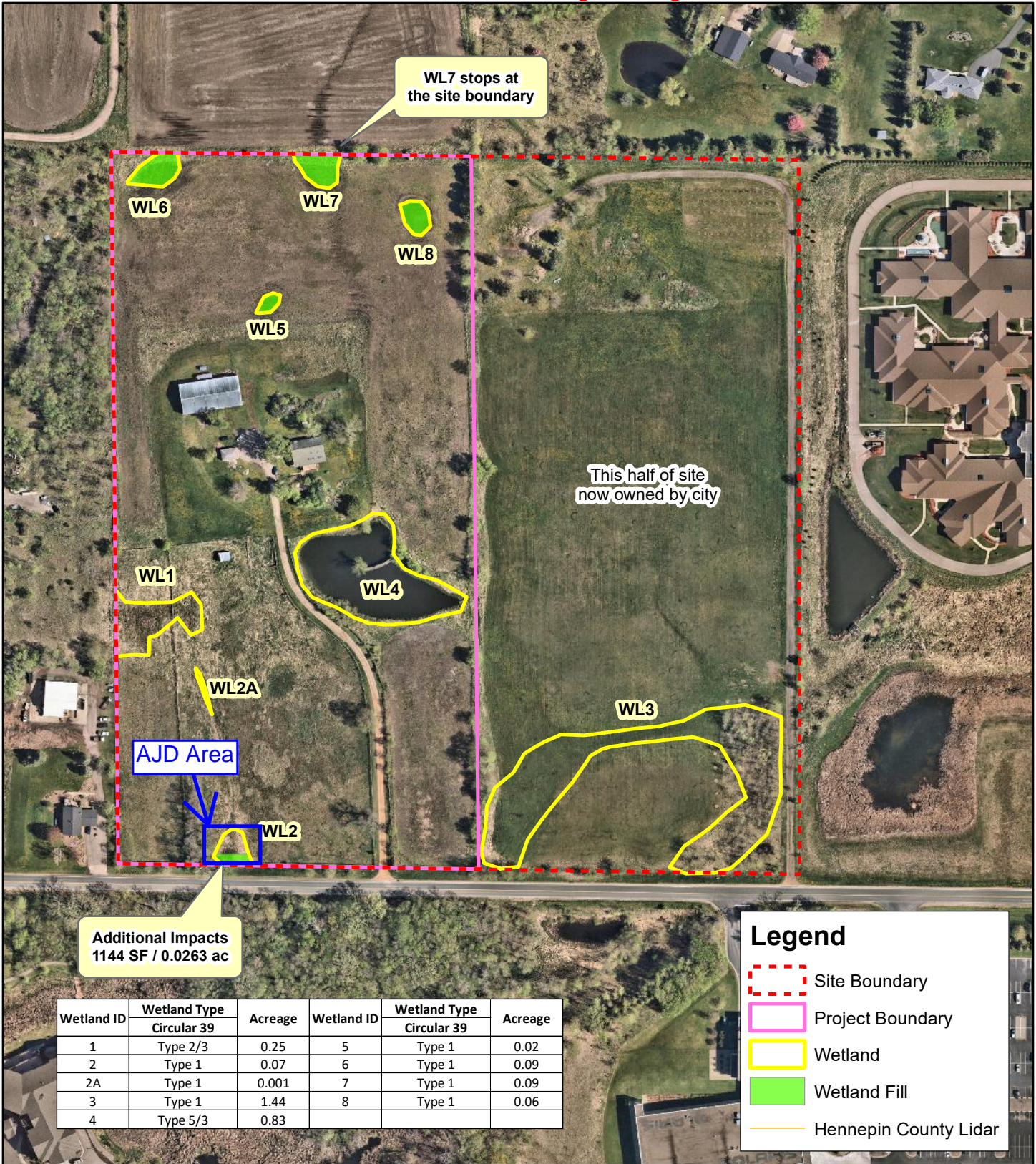
Figure 2 - Existing Conditions & Updated Proposed Impact Areas (2024 Henn County Photo)