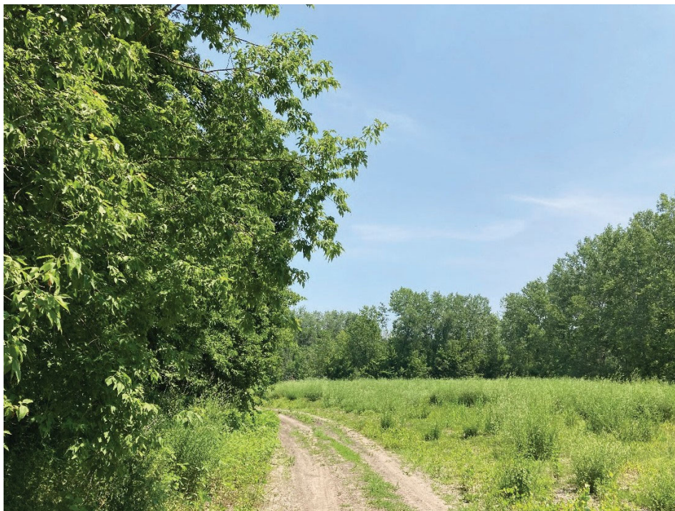
Figure 1. Site Setting with Access Road