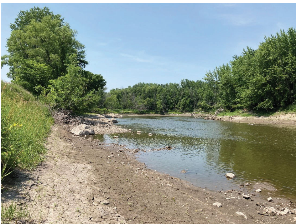
Figure 2. Site Setting Along Riverbank 1