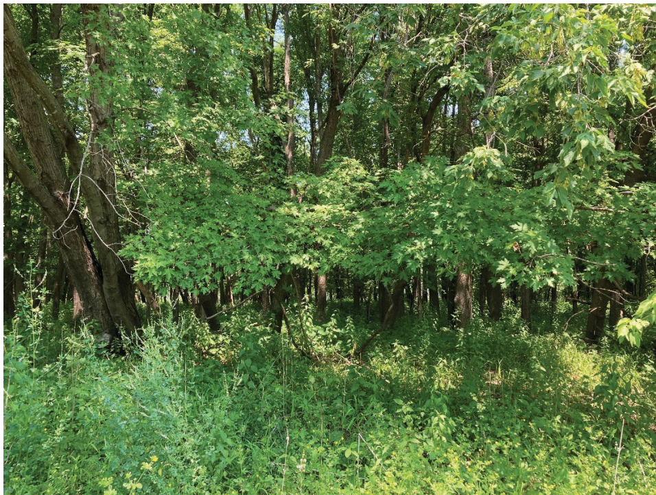
Figure 4. Typical Site Vegetation