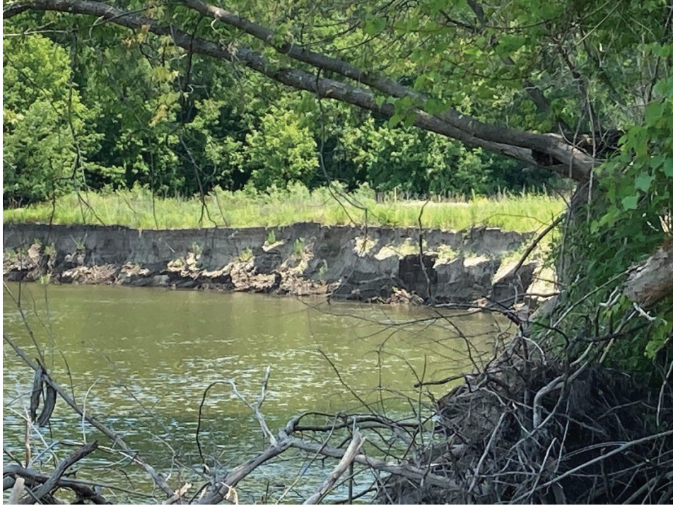
Figure 3. Site Setting Along Riverbank 2