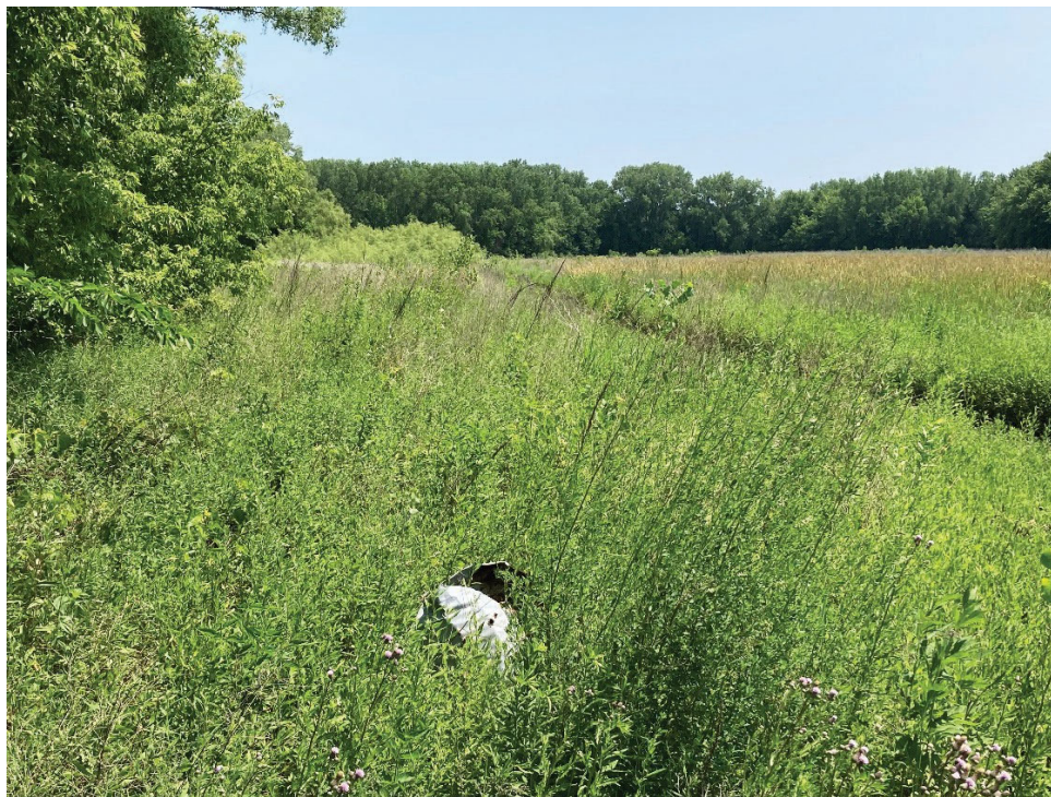
Figure 5. Occasional Piece of Debris