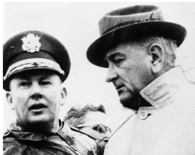
President Lyndon B. Johnson