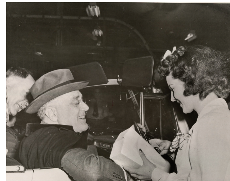
President Franklin Roosevelt