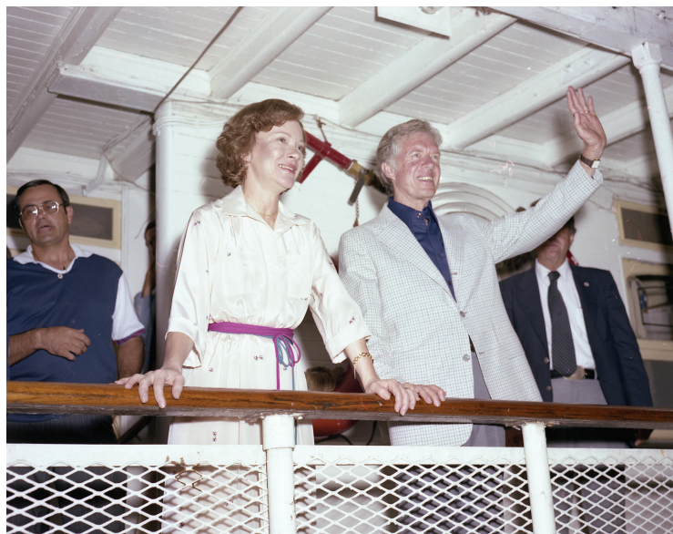
President Jimmy Carter