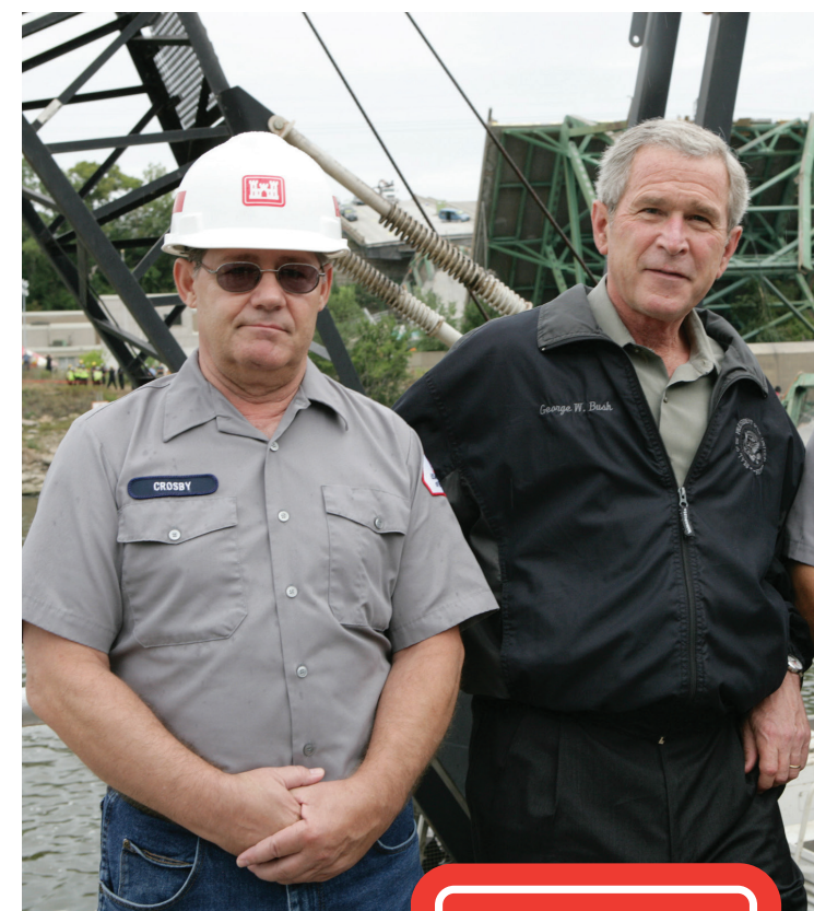
President George W. Bush