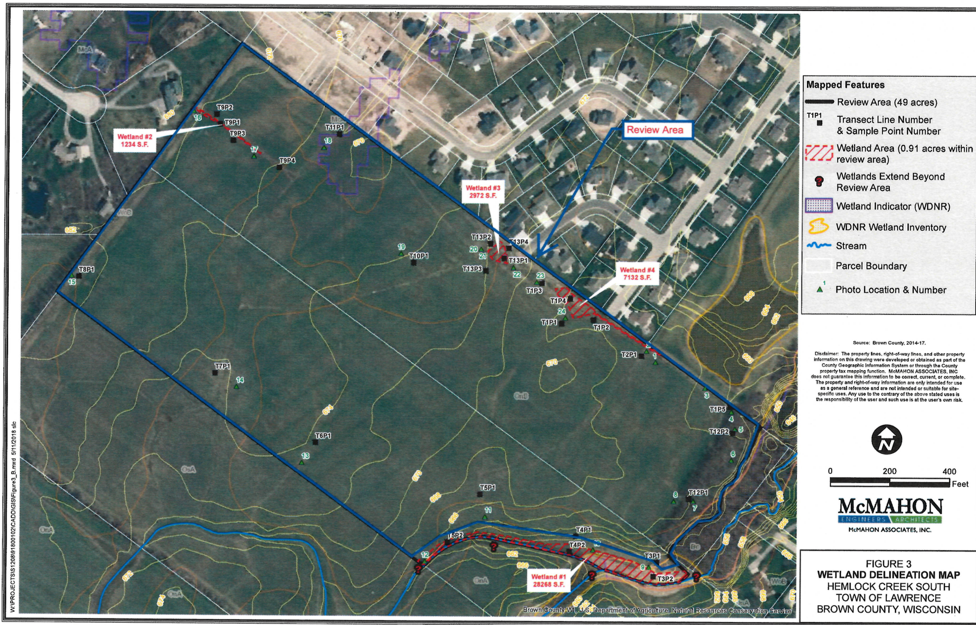
2018-01452-JLK (Figure 2 of 2)