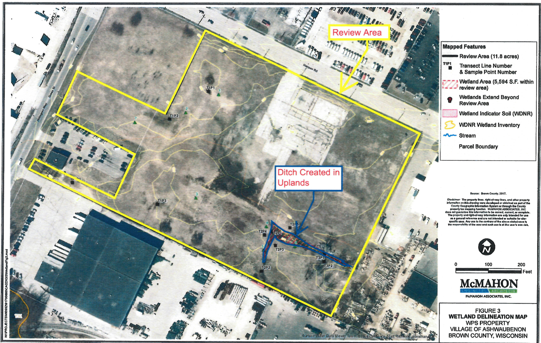
2018-01545-JLK (Figure 2 of 2)