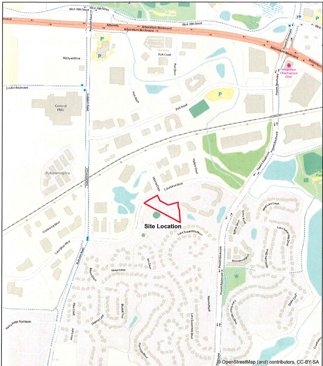
Figure 1 - Site Location