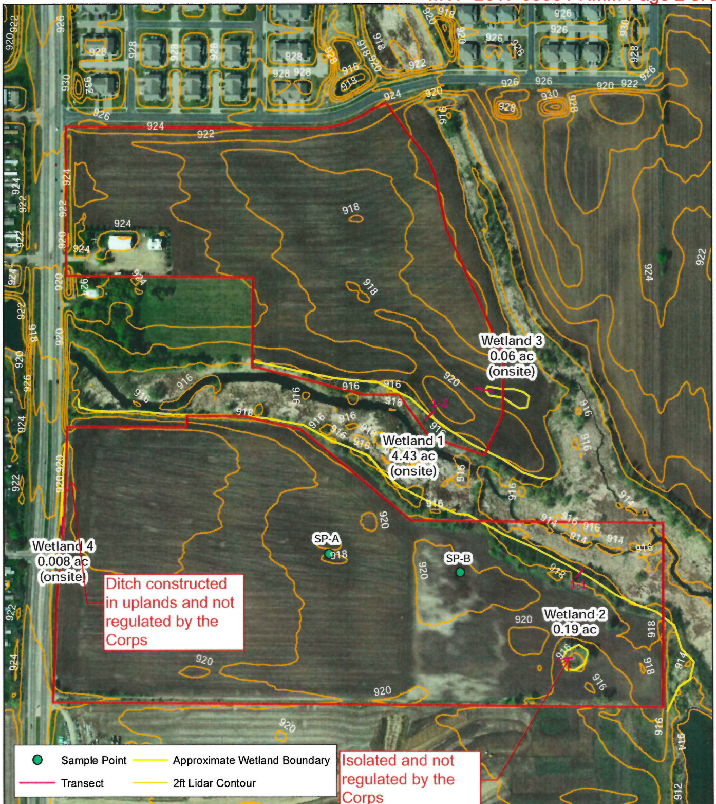
Figure 2 - Existing Conditions