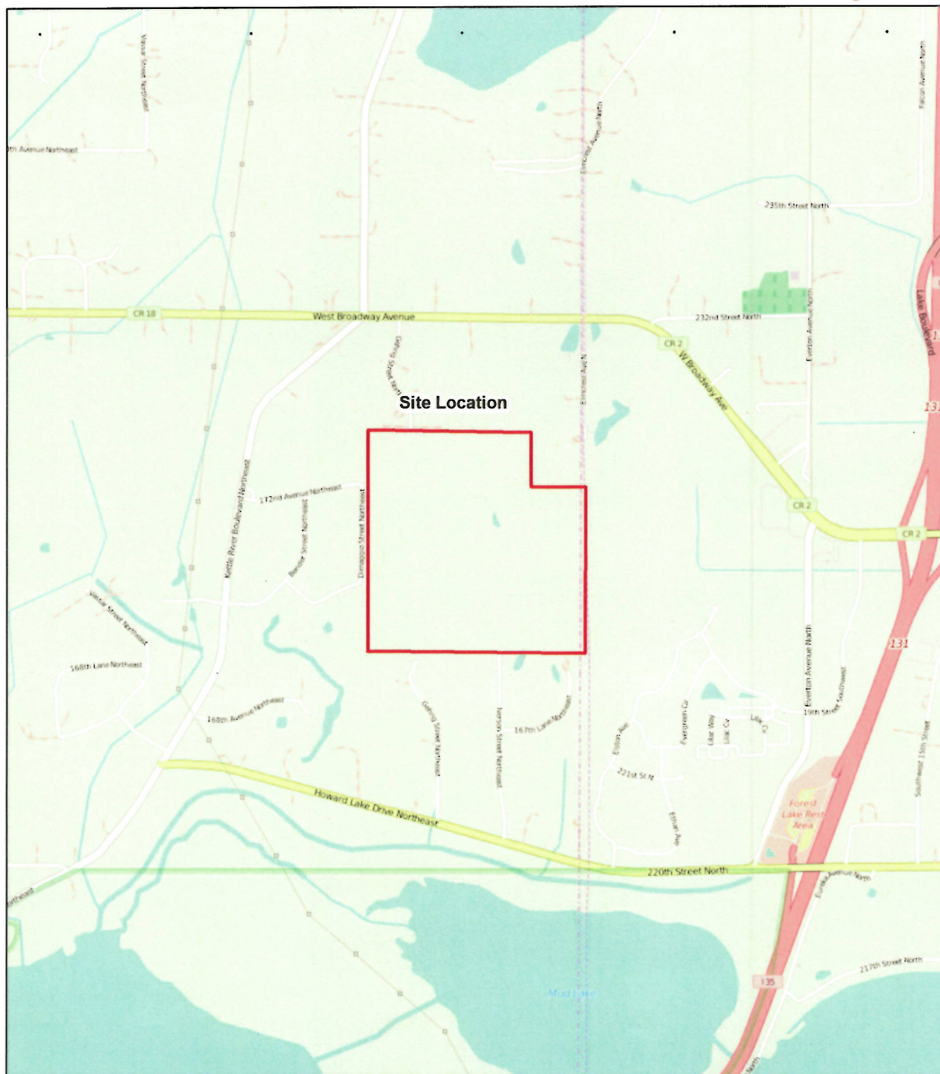
Figure 1 - Site Location